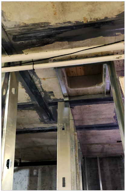
FRP laminates used for diaphragm strengthening (shown), with clips on stud walls (not shown).

to the surrounding retrofitted walls. CSS-CUCL, the only code-compliant precured laminate in North America, was specified instead of bolted steel plates because it is quicker to install and offers a lower surface profile.