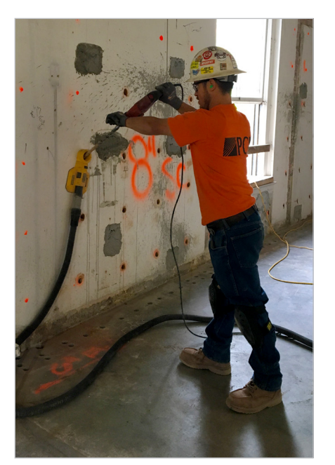
Drilling at the required 22.5° angle to install epoxied rebar before adding shotcrete to URM wall.

Simpson Strong-Tie Composite Strengthening Systems™ FRP laminates were installed on the underside of the upperstory concrete floors. The CSS laminates are used to transfer seismic forces from the floor